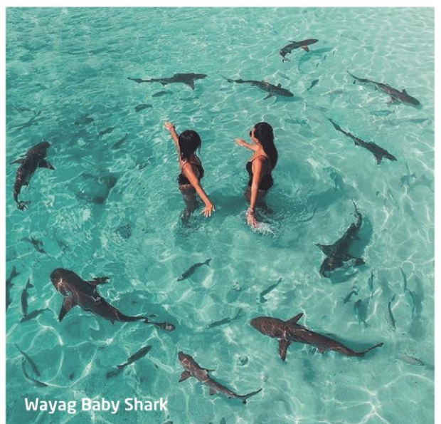
Wayag Baby Shark